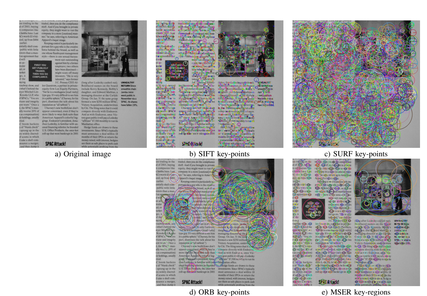
Fig. 1. Example outputs of the different key-points detectors for the same portion of a document image.

It is worth noting that both SIFT and SURF yield an integer-valued histogram while ORB and BRISK produce binary strings. Such binary descriptors are matched against each other with a Hamming distance which entails a much faster distance computation than the Euclidean distance calculation done for SIFT and SURF descriptors.