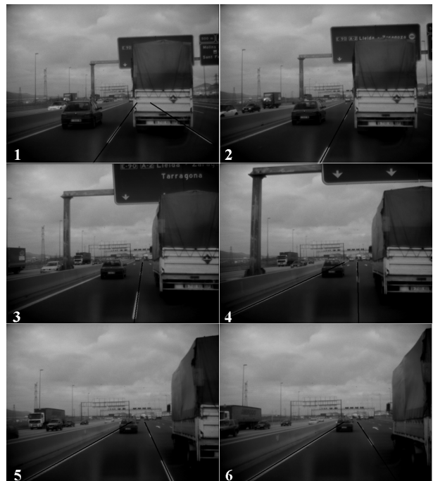
Fig. 3. Lane change in presence of a truck. The system identifies the manoeuvre and only shows the line we are crossing (2 and 3).