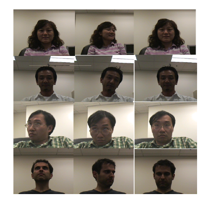
Fig. 2. Some samples from the Honda Video database.