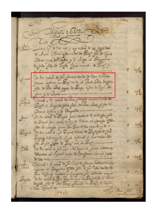
(a) Page with 8 registers.

The layout of these documents consists of separate registers, each in one paragraph. The structure of each of these registers is comprised by certain characteristics, such as the date of the wedding, the groom's name, the job and origin, the groom's parents' names, the bride's name, her father's name, and her home-town. We can see an example in Figure 2. Note, that not all data have to be present and that noise such as crossed out words may be present.