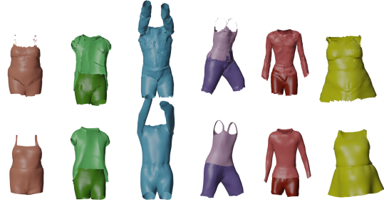
Figure 4: Qualitative comparison against CLOTH3D [7] baseline. Upper row: CLOTH3D. Lower row: DeePSD.

robust against skinning artifacts due to leg motion (see supplementary material for more details on blend weights).