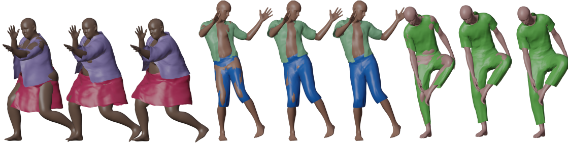
Figure 3: Qualitative results obtained by enforcing physical consistency. For each sample we show the results of each experiment in Tab. 3 in the same order from left to right.