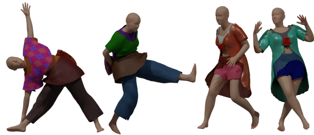
Figure 1: We present a novel approach for outfit animation. Our methodology allows generalization to unseen outfits. It can handle multiple layers of cloth, arbitrary topology and complex geometric details without retraining.

Virtual dressed human animation has been a topic of interest for decades due to its numerous applications in entertainment and videogame industries, and recently, in virtual and augmented reality. Depending on the application we find two main classical computer graphics approaches. On the one hand, Physically Based Simulation (PBS) [6, 17, 23, 24, 29, 30, 33] approaches are able to obtain highly realistic cloth dynamics at the expense of a huge computational cost. On the other hand, Linear Blend Skinning (LBS) [12, 13, 15, 20, 31, 32] and Pose Space Deformation (PSD) [3, 4, 16, 18] models are suitable for environments with limited computational resources or real-time performance demand. To do so, realism is highly compromised. Then, computer graphics approaches present a trade-off between realism and computational performance.