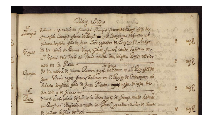
Figure 1. Sample of the Llibre d'Esposalles (Archive of Barcelona Cathedral, ACB).

Segmentation-based approaches [1], [2] require each document image to be segmented at word level, taking advantage of the knowledge of the structure of a document. The main problem of these approaches is that word classification is strongly influenced by over or under-segmentations.