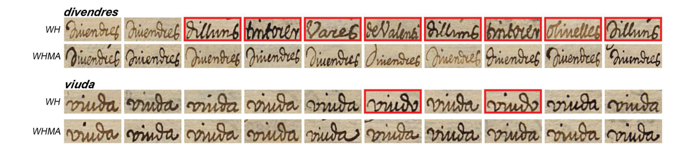
Figure 5. First words retrieved from configurations WH and WHMA for queries divendres and viuda. Red boxes stands for a false positive result.

As future work, we plan to develop a completely unsupervised approach where we do not need to predefine the key words, that is, a word spotting method with an open dictionary. The proposed method can be used in this way when we use a single example to train the model of appearance. The model just needs an unlabeled example, and it retrieves similar images based on appearance. We plan to improve the results using a similar approach to [13], which obtains state of the art performance for image retrieval learning a discriminative model with a single query image. Additionally, and taking advantage of our two-steps coarseto-fine approach, we can use in a smart way the first region spotting step to retrieve positive and negative examples in order to train a more robust discriminative model. Finally, it is important to note that the method presented is not invariant to scale due to the sliding window approach. A possible solution would be to include the pyramid-HOG [6] where the features are extracted from the images at different scales.