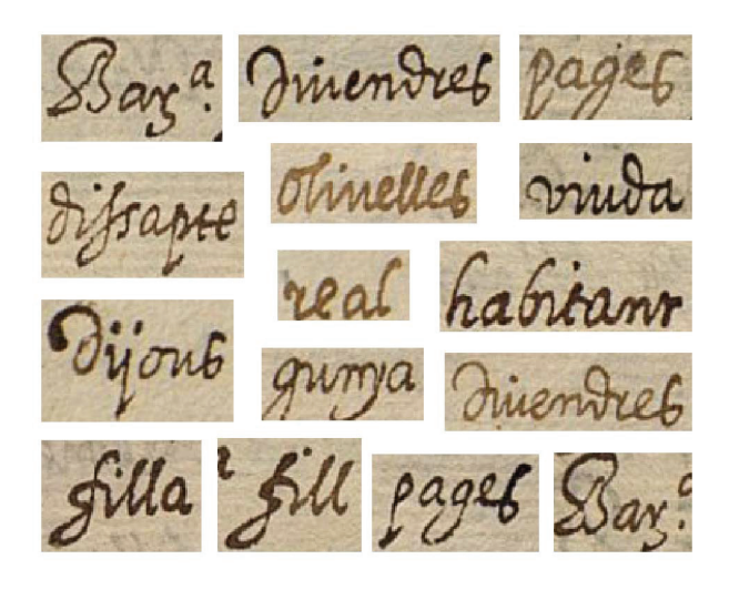
Figure 4. A set of words extracted from the dataset.

book contains the marriages of two years, and was written by a different writer. The original scanned documents have different ink and paper color tonalities, and they are degraded by lifetime and frequent handling. To keep the original appearance, documents were scanned in color. We show an example of the words in Figure 4. Information extraction from these manuscripts is of key relevance for scholars in social sciences to study the demographical changes over five centuries.